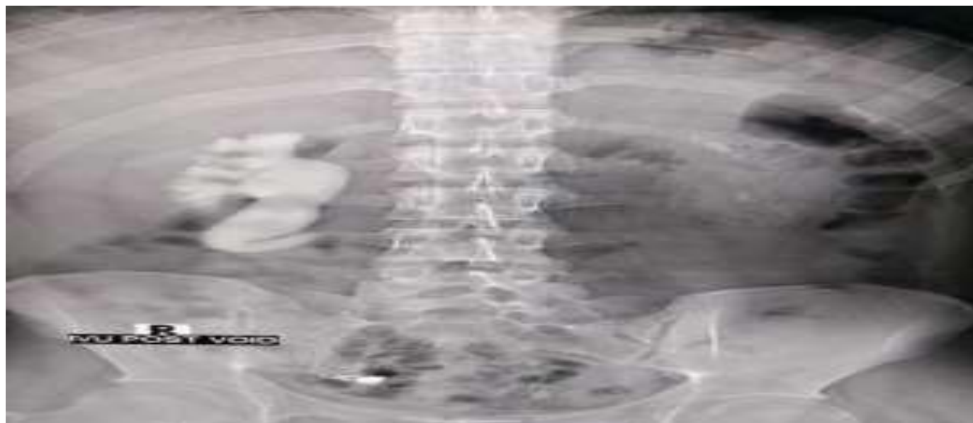
Figure 2: Diuretic renogram showing mild obstruction Intravenous urogram (IVU) was also done to confirm dilated ureter was coursing behind IVC, showing a Fish-hook sign.

The patient had retrocaval ureter-related moderate hydronephrosis, although he showed no symptoms for a few years. But he came with right flank pain for one month. A renal scan showed adequate functioning of the left kidney was seen with no outflow obstruction, whereas the properly functioning right-Sided kidney with sluggish clearance in response to diuretic stress (Figure 2).