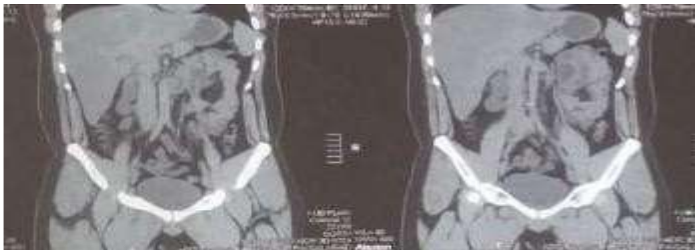
Figure 1: Coronal computed tomography of the abdomen and pelvis showing a visible intravenous contrast-dilated ureter flowing beneath the inferior vena cava. (Fish-hook sign)

The patient had retrocaval ureter-related moderate hydronephrosis, although he showed no symptoms for a few years. But he came with right flank pain for one month. A renal scan showed adequate functioning of the left kidney was seen with no outflow obstruction, whereas the properly functioning right-Sided kidney with sluggish clearance in response to diuretic stress (Figure 2).